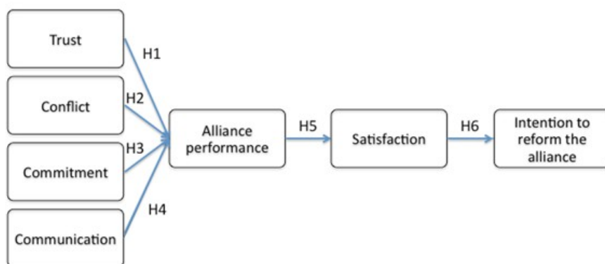
Figure 1. The research model

In this chapter, we develop a comprehensive research model based on a series of literature review. Based on the research framework, the hypotheses are developed to describe and verify the relationship among individual relationships, alliance performance, satisfaction and the intention of reform the alliance. The research framework is shown in Figure 1.