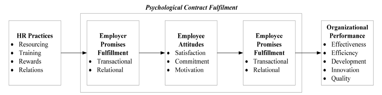
Figure 1. An HR practices – psychological contract – organizational performance linkage framework

because of psychological contract fulfilment (Rousseau, 1995). In more detail, the two systems of the proposed model are explained bellow: